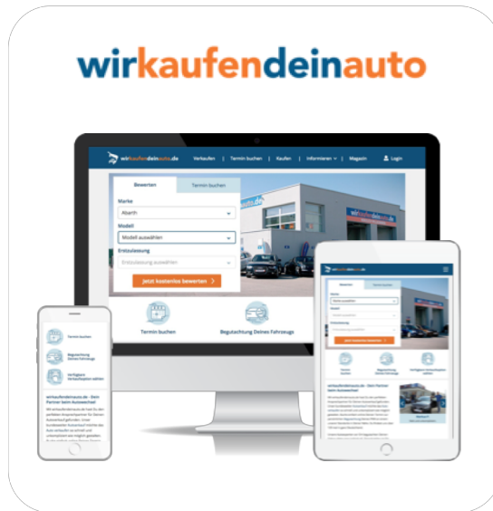
Europe's leading C2B used car buying platform