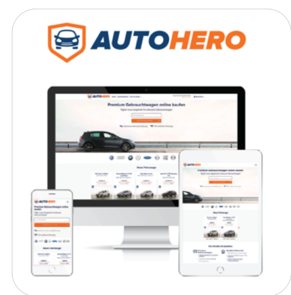
Europe's innovative online B2C retail platform for inspected high-quality used cars