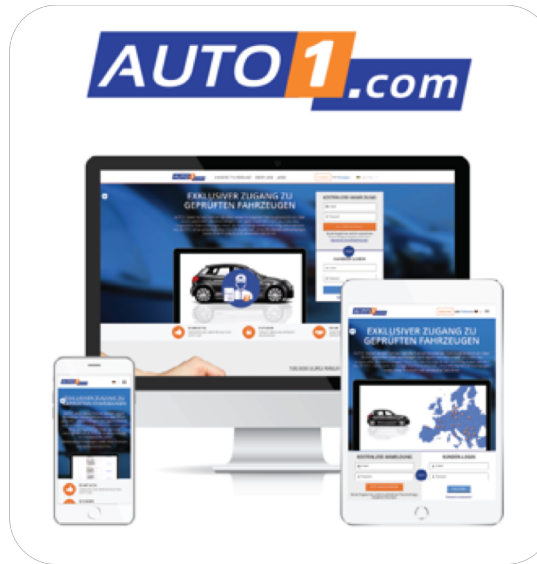
Europe's leading B2B online marketplace for buying & selling used cars