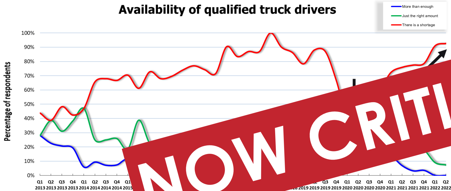
Availability of qualified truck drivers