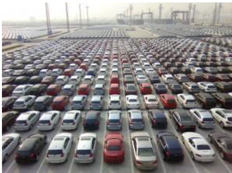
Shanghai port export ro-ro terminal

Citing data from the China Association of Automobile Manufacturers (Caam), the ECG report found that vehicle exports from China are up 33% compared to the same quarter in 2023. The main export markets for those vehicles in January and February were Russia, Mexico, Belgium and the UK. For the whole of 2023 Russia took the majority of vehicle exports from China. China exported 909,000 vehicles to Russia across the year, equal to a 90.9% share of all exports, and an increasing volume are being exported there by rail.